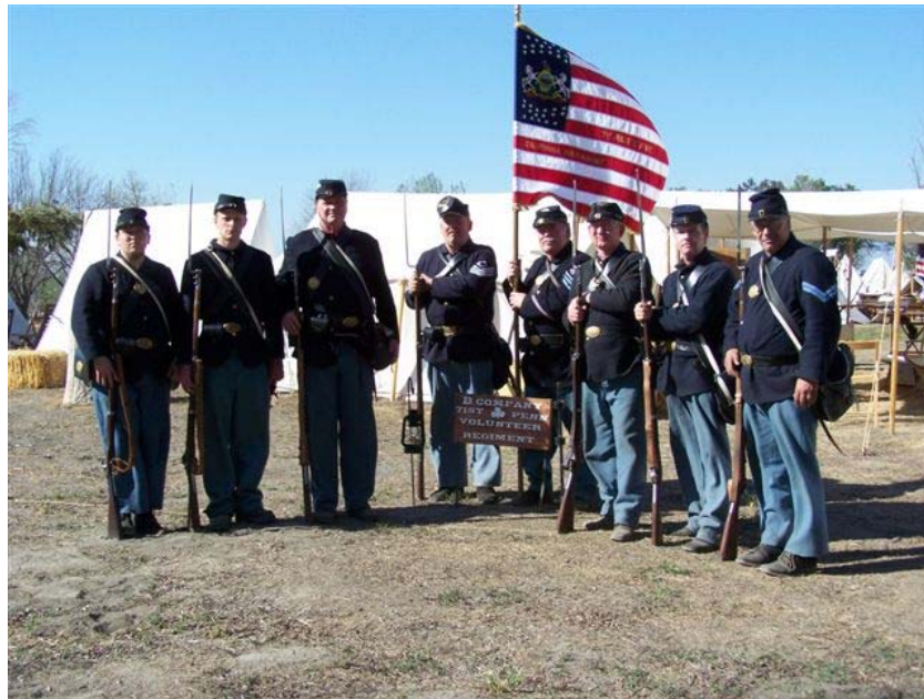
The men of Company B