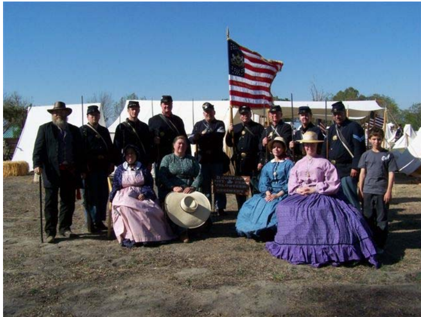
The 71 st at Prado Station