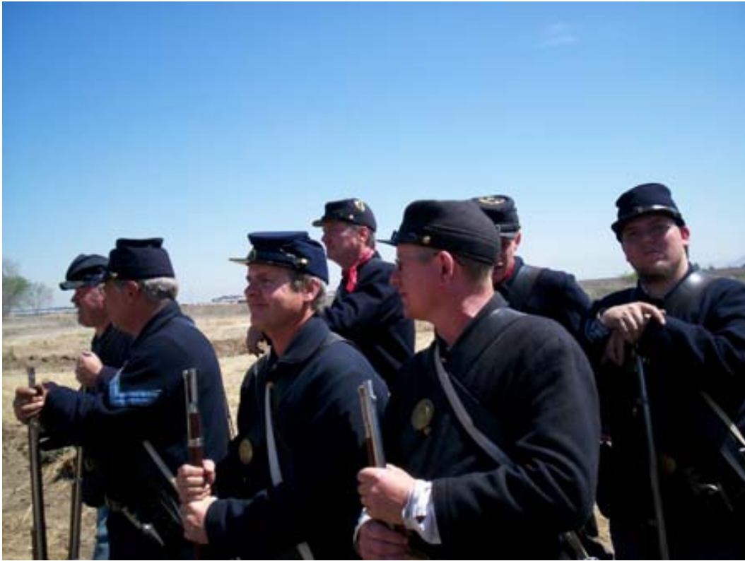
Waiting to be sent in