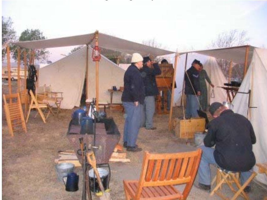
Cook prepares to ring the meal gong