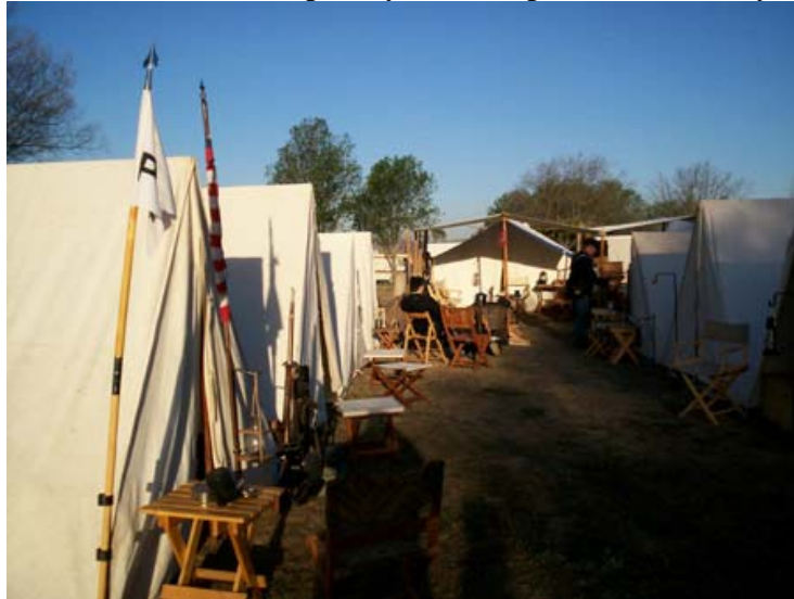
Our Company Street