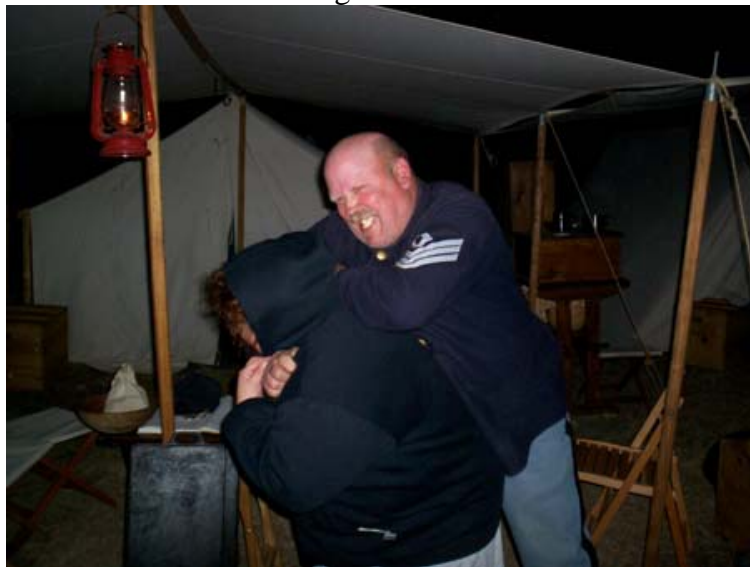
Never harass the 1 st Sgt or else – gads what a face!