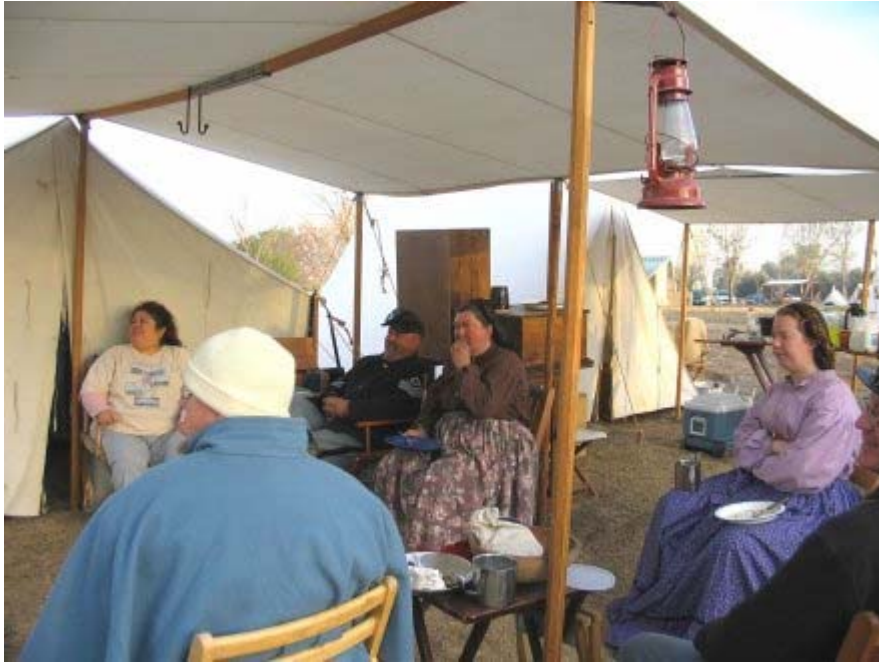
A time of fellowship – my favorite part of this hobby